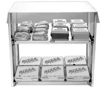
CMLW-2SG Multi-Level Warmer: 2 Slanted Shelves; Sneeze Guard; Side Panels; Light under top level 900 Watts / 7.5 amps / 120 Volts / 60 Hz