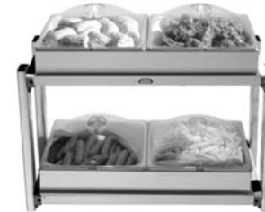
CMLB-24P Multi-Level Buffet Server: 2 Level Shelves; 2 Steam Pan Holders; 4 Half Size Steam Pans w/Clear Lids 600 Watts / 5 amps / 120 Volts / 60 Hz

Models CMLW-2, CMLB-24P, CMLW-2S, CMLW-2SG