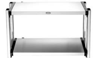
CMLW-2 Multi-Level Warmer: 2 Level Shelves 600 Watts / 5 amps / 120 Volts / 60 Hz