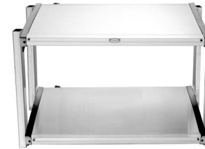
CMLW-2S Multi-Level Warmer: 2 Slanted Shelves 600 Watts / 5 amps / 120 Volts / 60 Hz