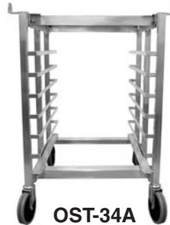
OST-34A Half Size with Wheels