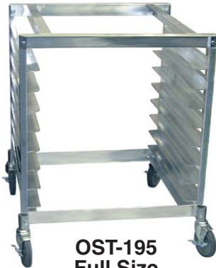
OST-195 Full Size with Wheels