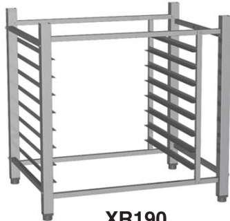
XR190 Full Size