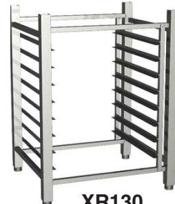
XR130 Half Size