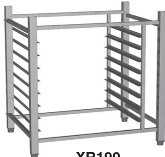
XR190 Full Size