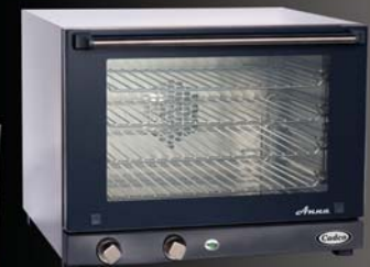
208-240V Half Size