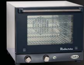
120V Quarter Size