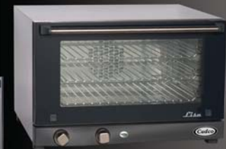
120V Half Size