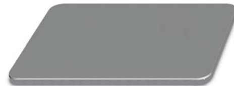
TG450 Full Size