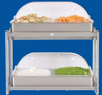
Multi Level Buffet Servers