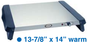
WT-5S: Small Countertop Warming Shelf, stainless