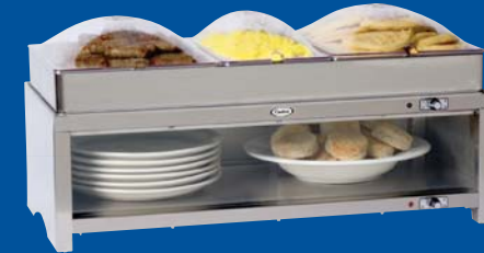
Warming Cabinet/ Buffet Servers