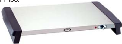
WT-10S: Countertop Warming Shelf, stainless Same as WT-100 except: