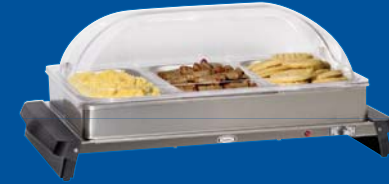
Triple Buffet Servers