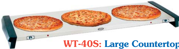
WT-40S: Large Countertop Warming Shelf, stainless