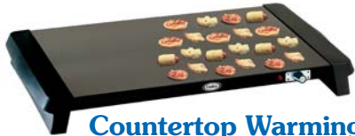
WT-100: Countertop Warming Shelf, black