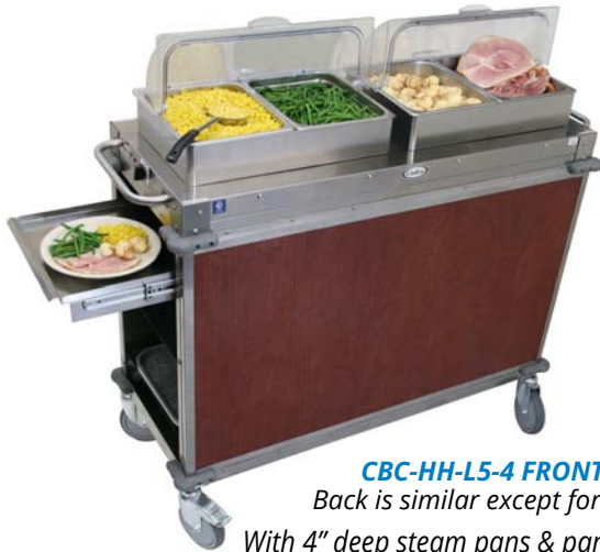
CBC-HH-L5-4 FRONT; Back is similar except for cord With 4" deep steam pans & panholders

Model Variations include: 2 1/2" or 4" deep steam pans; CladRex™ Laminate panels in a selection of colors, OR Stainless panels (4" deep pans NOT meant for use with meats unless only filled halfway)