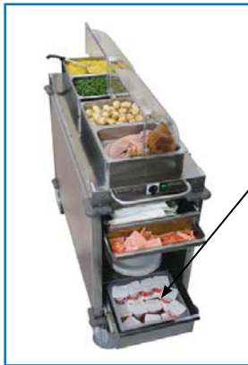
Side views: Total of 4 drawers & 3 shelves

Cold Drawer: Great for yogurt cups, fruit cups & more!