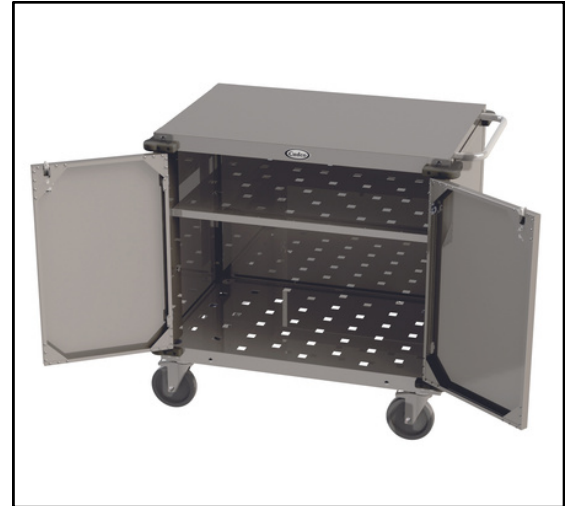
1 adjustable height shelf